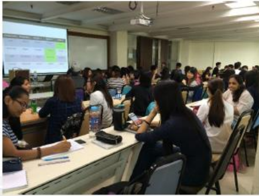
University College Sedaya International Kuala Lumpur