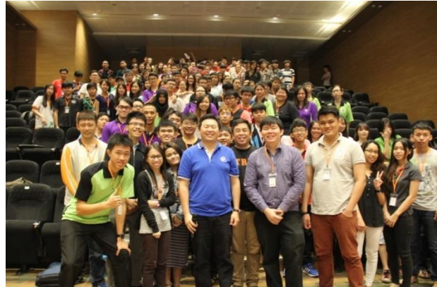
University College of Technology Sarawak Sibu