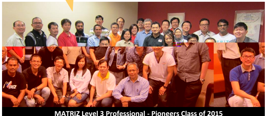
MATRIZ Level 3 Professional - Pioneers Class of 2015

Kudos to the 31 pioneers for passing the International TRIZ Level 3 Professional certification test.