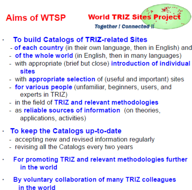
Fig. 1. Aims of the WTSP project [1]

We started the World TRIZ-related Sites Project (WTSP) in Dec. 2017 as a voluntary project for building Catalogs of selected websites on TRIZ and relevant methodologies in the world. Toru Nakagawa proposed the project, got supports from a number of people, and the six co-authors of the present paper joined to serve as Global Co-editors.